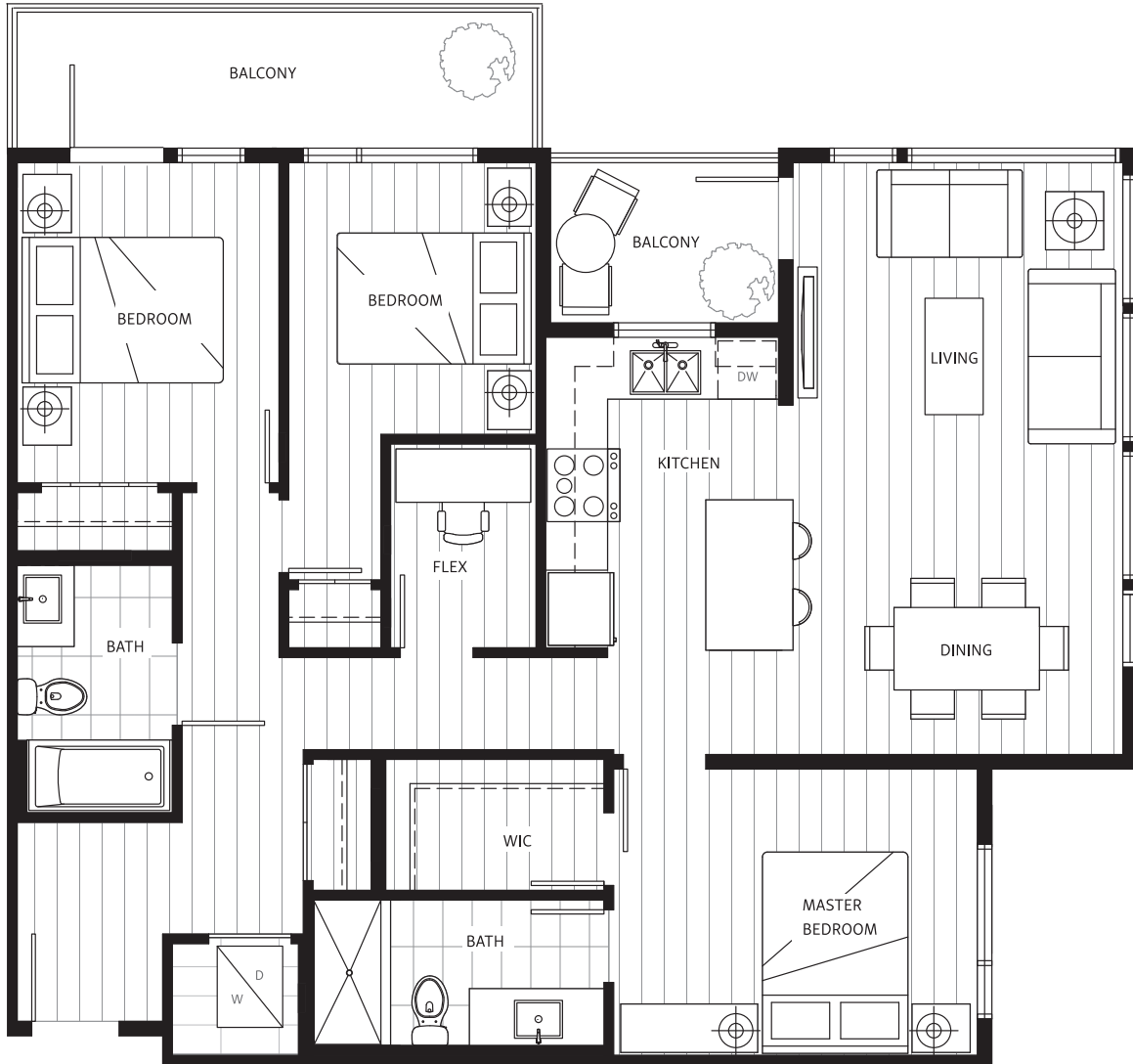
WEST | MAIN