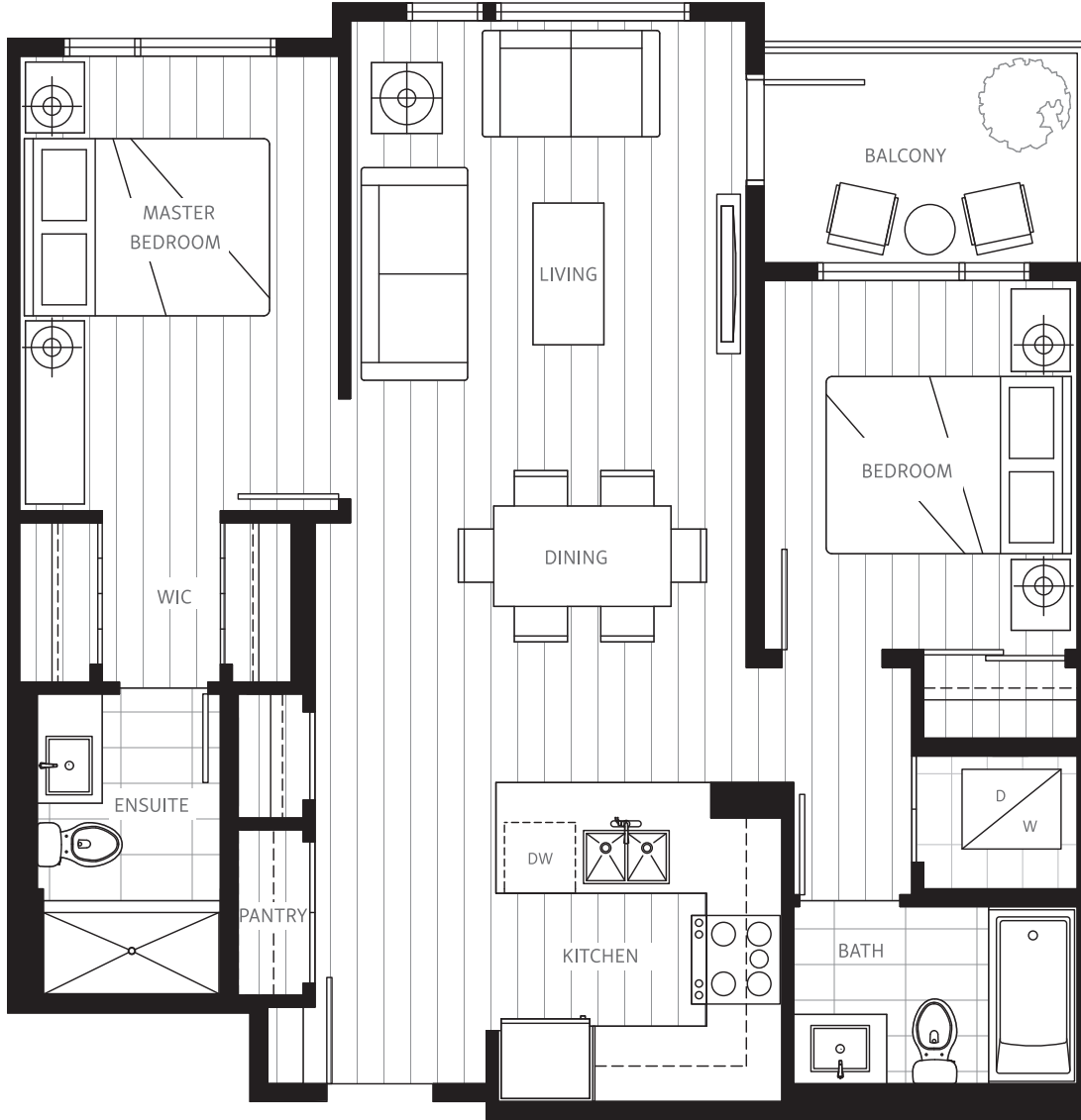
WEST | FLOOR 2 TO 6